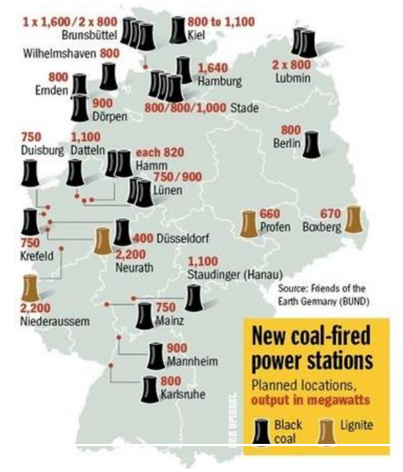
Figure 2 Predicted deployment of coal power plants in Germany

Nevertheless, the German way of nuclear phase-out seems a bit fast and however environmentally justified this move can be, I don't think that it is economically sufficient way to do this kind of process. It could be truly justified only if the grid interconnections were in a better shape or if there was invented and deployed an efficient cheap system for storing electricity, but both of these scenarios are really unlikely to happen unfortunately in the near future unlike the German Phase out of nuclear. From this extreme example we can transfer our view to another in Czech Republic.